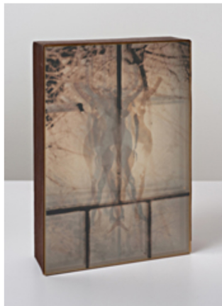
Robert Heinecken, Venus Mirrored , 1968, in "Photography into Sculpture" at Cherry and Martin

Jackson's long friendship with Bruce Nauman comes to mind when viewing Negative Numbers (1970-2011), a pair of translucent porcelain rectangles with black numbers written on them, mounted on a table and lit from behind by electric light. The piece is included in an ambitious if uneven collection of oddities titled "Photography into Sculpture" at Cherry and Martin in Culver City. The show restages Peter Bunnell's 1970 exhibition at the Museum of Modern Art, which included a number of L.A.-based artists.