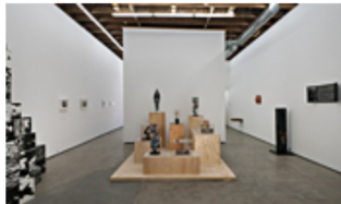
"Photography into Sculpture," installation view, at Cherry and Martin